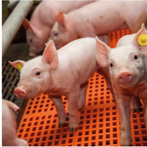
Energetic piglets drink colostrum sooner.

Newborn piglets need energy and immunity for survival and growth. Colostrum perfectly meets these needs. However, ever larger litter size is increasingly leading to some piglets suffering from insufficient colostrum uptake. This seriously jeopardizes their chances of survival.